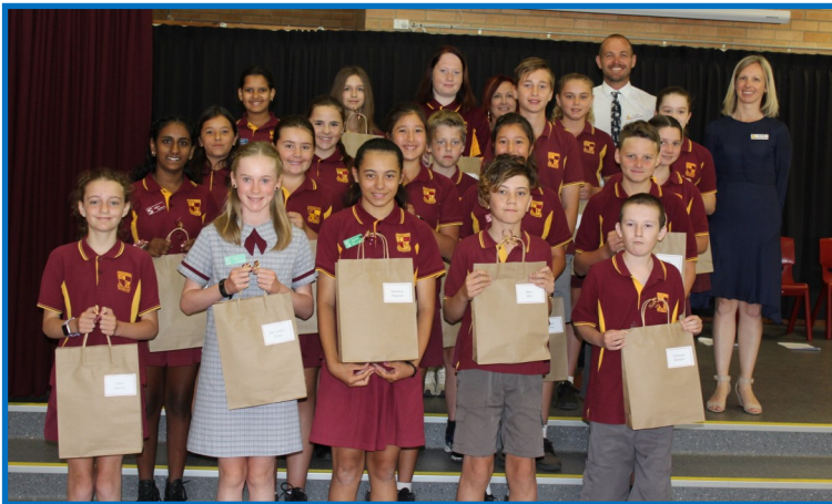
Year 6 Graduation