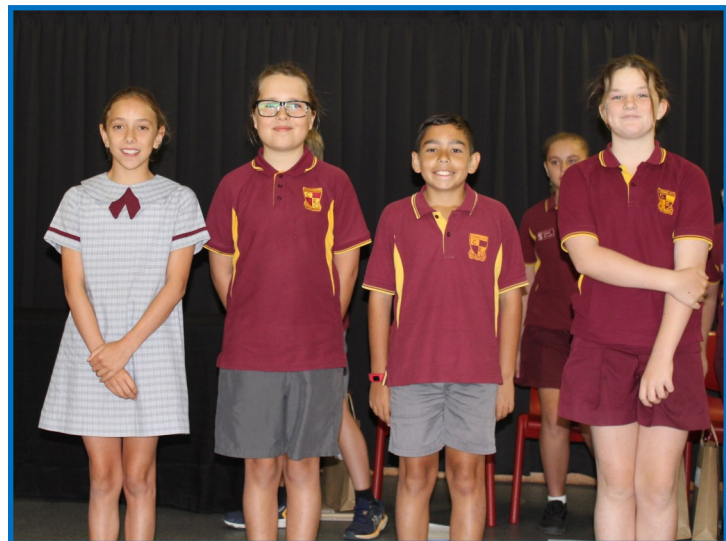
School Captains & Vice - Captains 2021