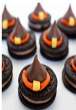
OREO WITCH'S HATS