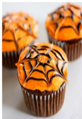
SPIDER WEB MUFFINS