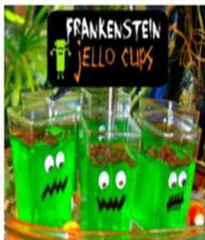
FRANKENSTEIN JELLY CUPS