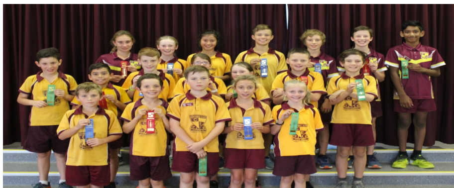
3-6 1st, 2nd & 3rd