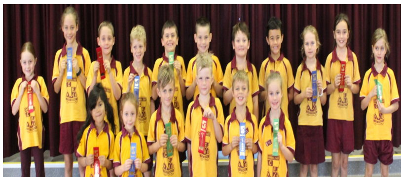
K-2 1st, 2nd & 3rd

Woolies Earn & Learn is back. Please bring in your sticker charts to the collection box in the foyer.