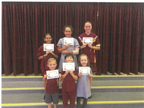
← Bronze Awards