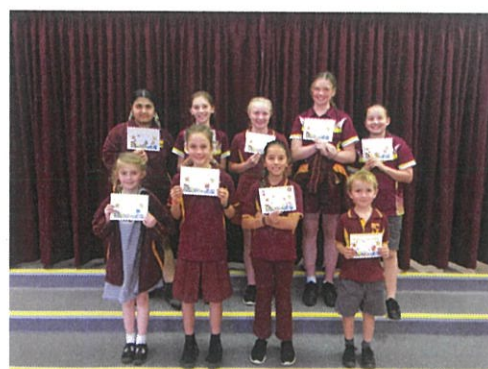
Gold Awards →